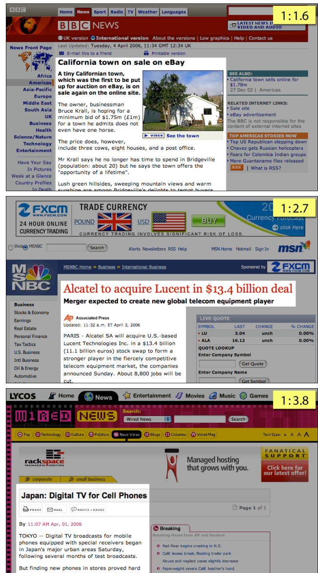
Figure 1: Visual signal-to-noise ratios for articles on popular news sites

Signal-to-noise is a principle that measures the ratio between the signal, or relevant information, and the noise, or extraneous information, contained in a design. A high signal-to-noise ratio results in more effective communication, while a low ratio reduces usability because it asks users to filter out noise in order to receive and interpret information [10]. Many web pages have low signal-to-noise, as much of the display area is given over to the browser interface, advertising, navigation, and branding (Figure 1) [13].